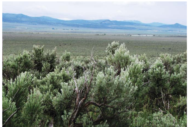
Bonneville big sagebrush provides excellent wildlife habitat.

Al believes that Bonneville big sagebrush is a hybrid between Wyoming and mountain big sagebrush ( A. t. subsp. vasayana ). Although he stops short of calling it another subspecies, he mapped it on the Curlew because of its importance for wildlife.